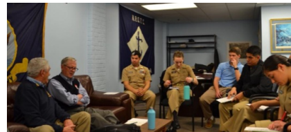
Alumni Panel Discussion with Midshipmen