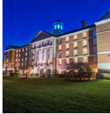
Courtyard by Marriott, Chapel Hill

Room reservations are separate from the GAA registration. Cut off for rooms at the discounted block rate for each hotel is 2 Oct 2018.