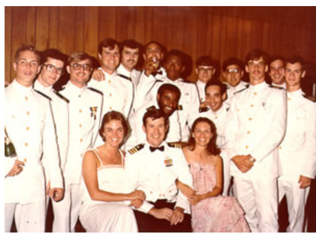
Class of 1978 Spring Ball